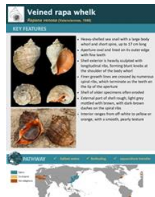
Veined rapa whelk | Rapana venosa