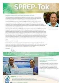
SPREP-Tok : Issue 81. November, 2021