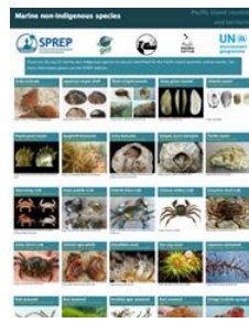
Top 25 Marine Non-Indigenous Species in the Pacific Region