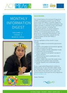
ACP MEAs Monthly Information Digest: Vol 2, Issue 3. March 2022.