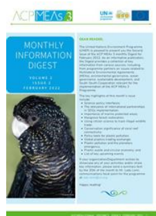
ACPMEAs Monthly Information Digest: Vol 2, Issue 2. February 2022