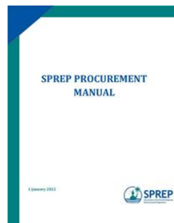
SPREP Procurement Manual 2022