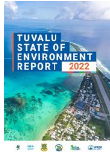
Tuvalu State of Environment Report 2022