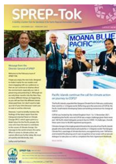
SPREP-Tok : Issue 82. December 2021 - February 2022.